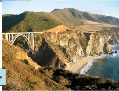
Bixby Bridge with Brazil Ranch in background. Buildings are not visible for State Highway One